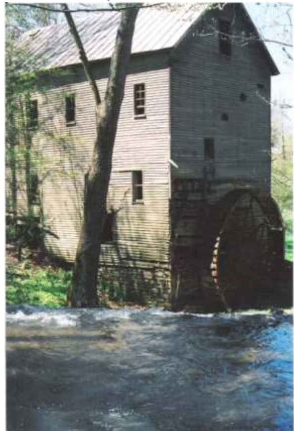
Jessee's Mill Spring 2005