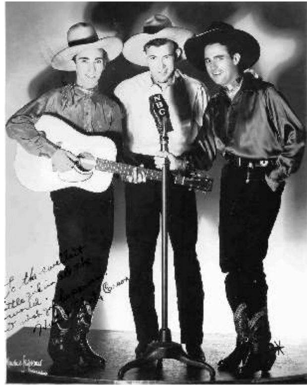
Sons of the Pioneers