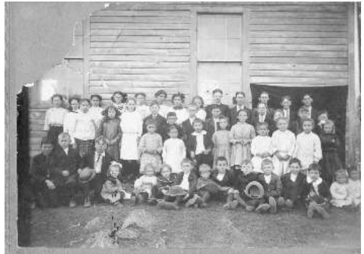
Jessee School Photo 2