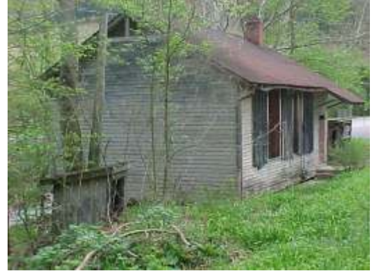
Jessee School at Jessee's Mill

By the way, I recently obtained another Confederate reunion photo, which is sure to have some Jessees in it at http://russellvets.org/ .