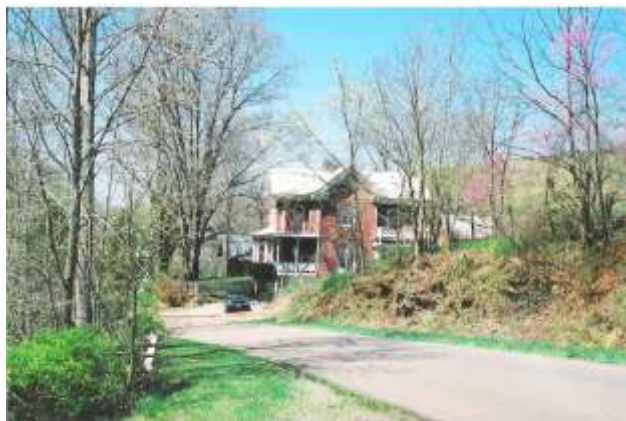
Andrew Jackson Jessee Historic Home, Spring 2005