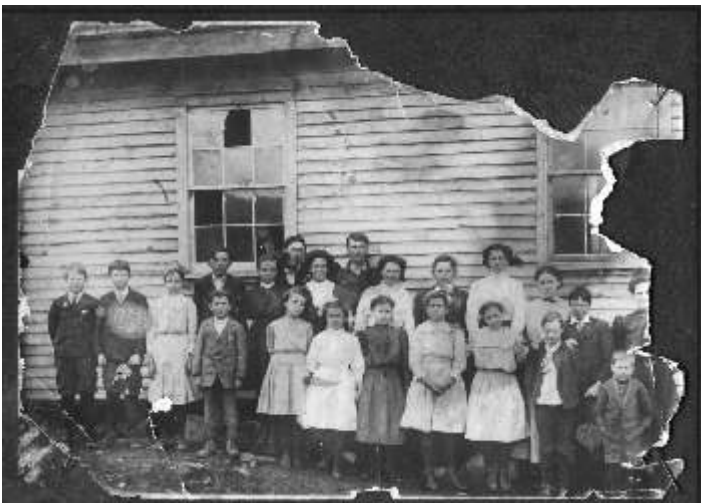
Jessee School Photo 1